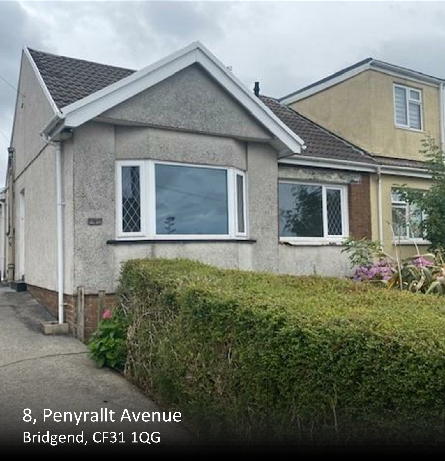
8, Penyrallt Avenue Bridgend, CF31 1QG